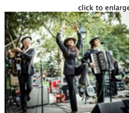
VickiKristinaBarcelona